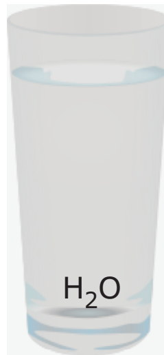
H 2 O